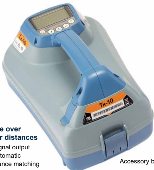
Accessory base tray

90V signal output and automatic impedance matching