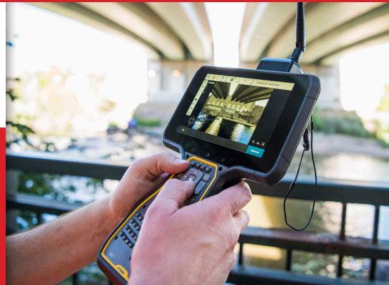
Trimble TSC7 Controller