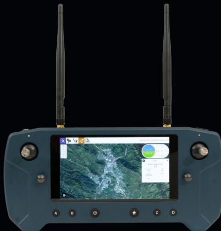
HereLink Blue | Live Video GCS