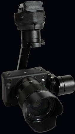
Sony ILX-LRI | Gmsy Pixy LR