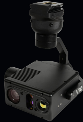
Gmsy VIO F1